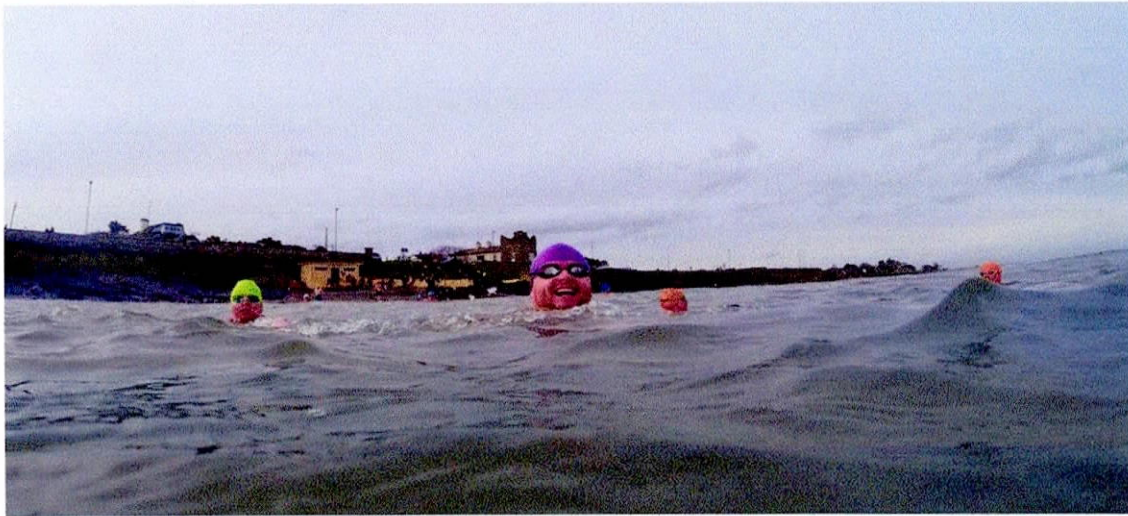
Swimmers off Low Rock Aug 18

Importantly, the Island Swim takes place from Ireland's Eye to Balcadden Bay in Howth, with the swimmers following a course that takes them within 2 kilometres of the proposed waste discharge diffuser and well within the reach of the anticipated plume dispersal area.