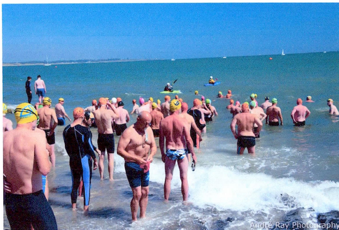
Participants in Low Rock Sea Swim July 18

Thank you for the opportunity to make this oral submission. We are active year-round swimmers in the Malahide, Portmarnock and Howth areas. We are part of the local Low Rock, Malahide sea swimming community, most of whom swim daily, ranging in age from 20 years old to the mid-80s. We are speaking on behalf of this group. There are several such informal local swimming groups dotted along the north Dublin coastline.