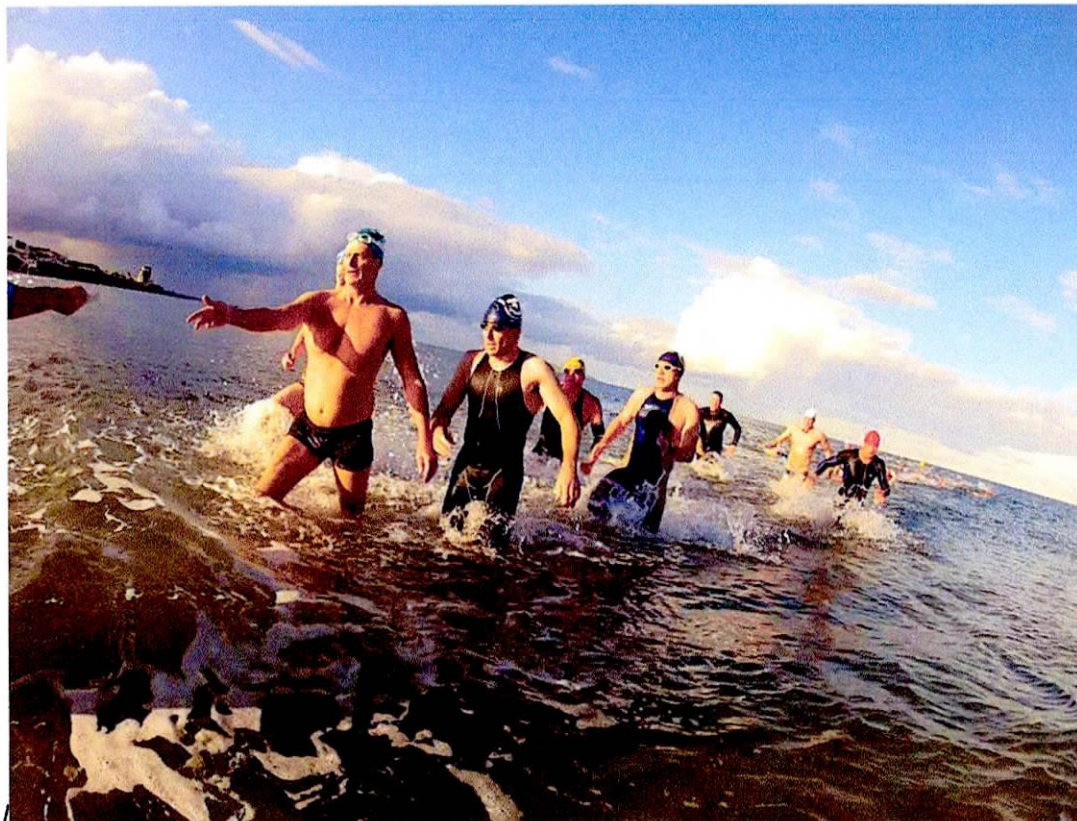
Finish to Aer Longus Sea Races at Portmarnock Beach, June 18

The races can take swimmers 500 to 750 metres off shore. Longer distance swimmers, accompanied by boat, regularly traverse open waters, variously between Howth, Ireland's Eye, Sutton, Malahide, Rush and Lambay Island.